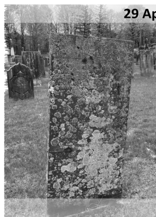
29 April 2023

Scrubbing in a circular motion sometimes results in "suds." Use the long side of a paint stick to "squeegee" the surface, leaving suds within the inscribed letters.